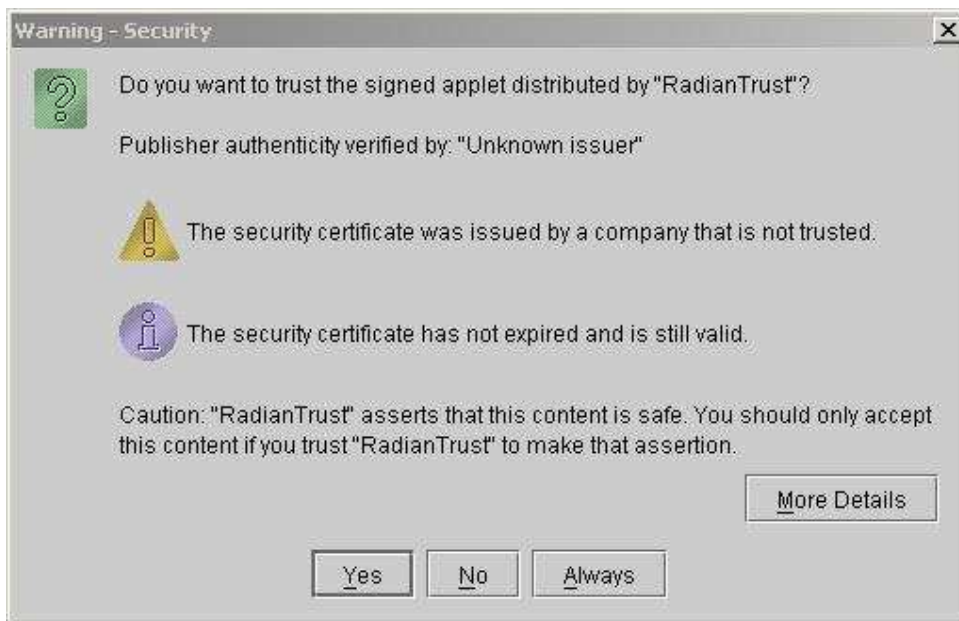
Diagram 1.4 Watermarked Printing (Trust Security Certificate)