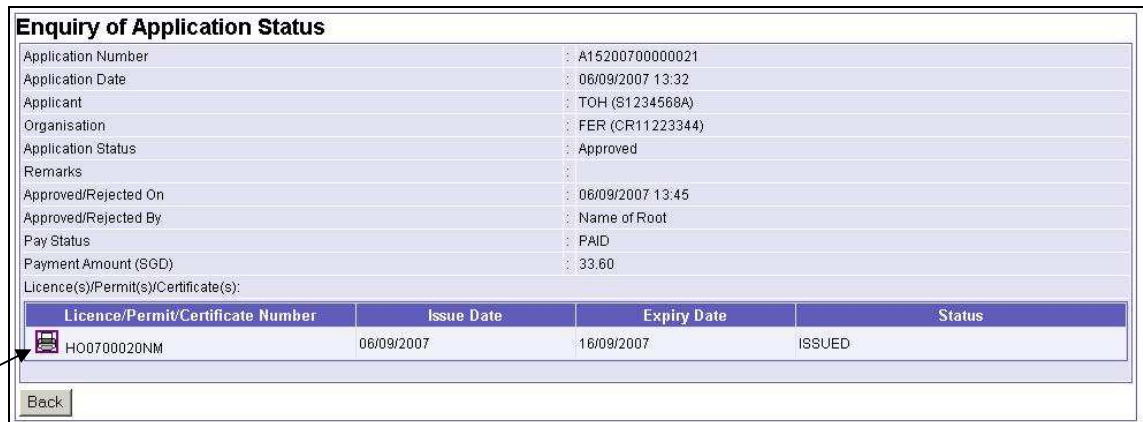
Diagram 1.2 Watermark Printing - Paid